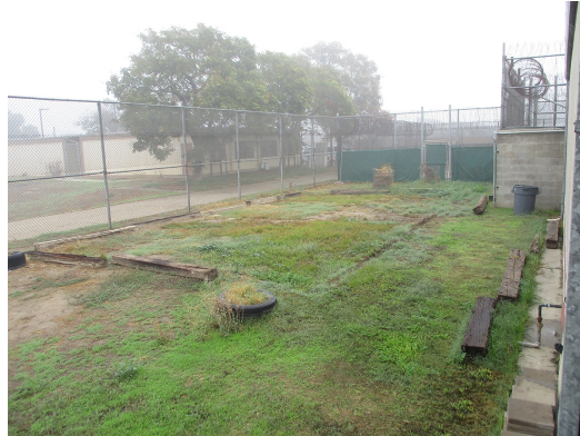
Photo: A section of the yard at KCJC.

community, saying that the treatment they got at the detention center was better than in the community. This reflects a bias for spending funds only on institutional care that perpetuates recidivism and costs the County more in the long run. Further, the average length of stay for youth in Kings County awaiting an out-of-home placement is among the longest in the state relative to other counties. Kings County has failed to develop community-based placements to meet the needs of these youth, who often have behavioral disabilities. These long waits post-disposition are extremely harmful to youth with disabilities.