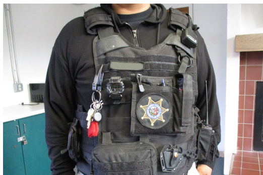
Photo: Probation staff wear tactical vests.

Third, Probation staff in tactical gear improperly interfere in the J.C. Montgomery school at the detention facility, monitoring students’ work and behavior without regard to students’ special education accommodations. Unlike most other youth facilities, Probation, mental health and school staff have no regular process to review incident reports, discuss the needs of various youth, and coordinate supports to disabled youth.