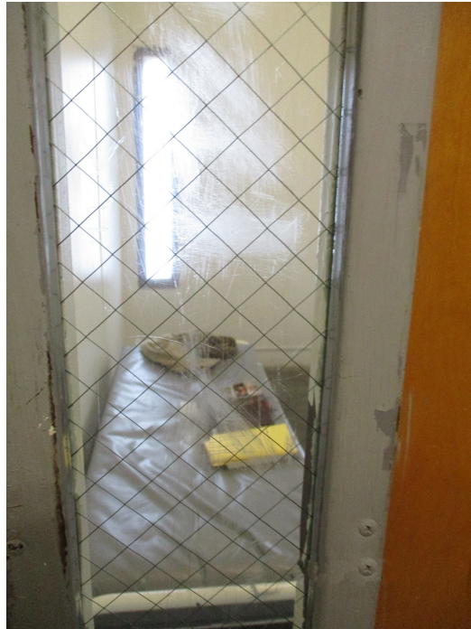
Photo: Another cell at KCJC as seen through the small door window.

including abuse, threats of violence, bullying, theft, sexual abuse, sexual harassment, and assault.” 15 Yet, Probation staff routinely use excessive physical force, sometimes “body-slamming” youth to the ground for minor violations such as defiance. Staff also use mechanical restraints such as handcuffs, leg irons, and full body “WRAP” devices to control youth under their care, including youth with disabilities and those experiencing mental health crises. An earlier state inspection revealed that restraints – including leg shackles and the full-body WRAP – were used on youth who posed no threat to themselves, others, or to even to property, and that Probation staff likely undercounted use of force incidents because they were not properly identifying use of restraints as a use of force. Discipline logs show that youth are sometimes placed on “leg-iron status” for days at a time.