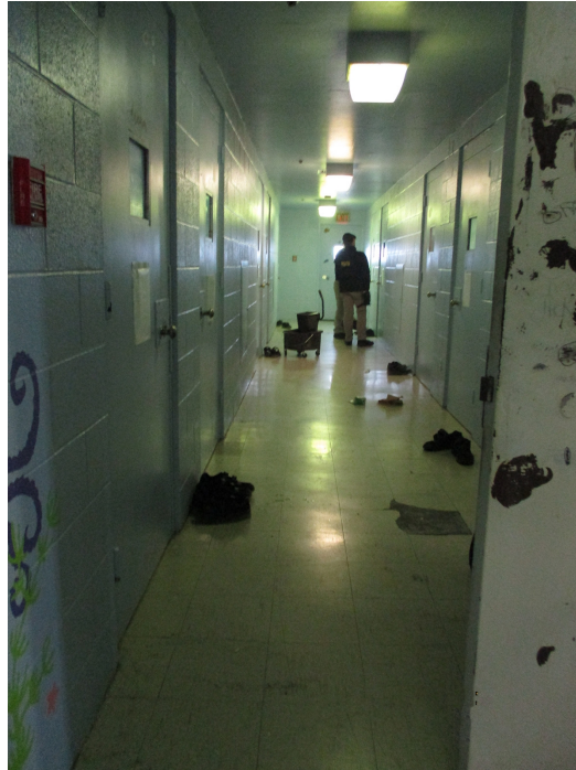
Photo: A hallway at KCJC.