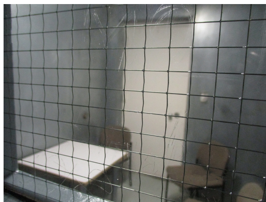
Photo: An interview room at KCJC as seen