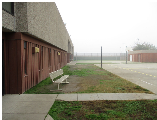
Photo: The exterior of the detention center.

Second, the youth detention center is prison-like and regimented, rather than the homelike, rehabilitative environment that state law requires. Youth are routinely pepper sprayed in their cells, day rooms and classrooms, often in their face and eyes. For minor infractions, youth are shackled and “body-slammed” by custody officers or forced to sit alone in hallways for hours at a time. Young people with mental health and behavioral disabilities are disproportionately subject to these practices, which lead to serial discipline, court reports and extensions of their length of stay. Organized activities and outdoor exercise are limited, so youth endure forced idleness, or at best, hours of watching TV in the dayrooms. The incentive program is frustrating and confusing, especially for disabled youth. These conditions re-traumatize many youth with a history of trauma held at the facility.